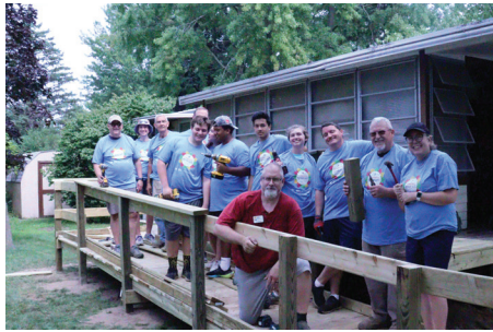
Trinity Lutheran Church volunteers build a ramp