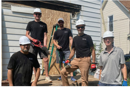
Volunteers from BDR Custom Homes rebuild a porch