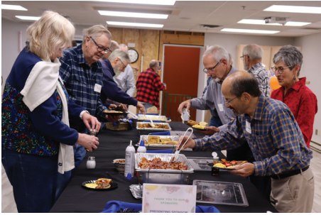
2023 Volunteer Appreciation Breakfast