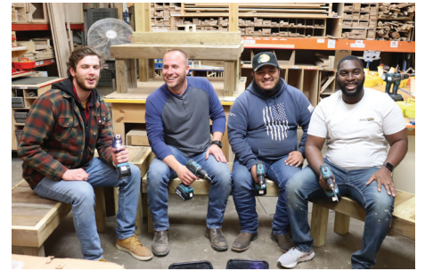
National Nail volunteers build benches