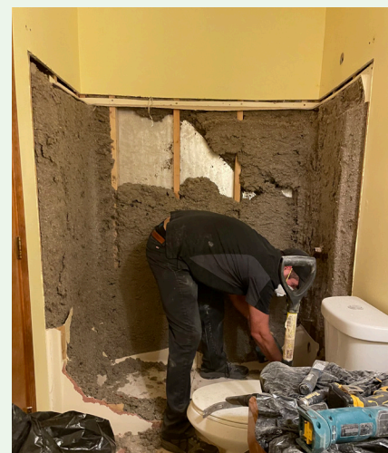
It all starts with removing the existing bathtub.