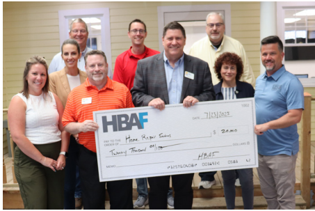
HBA Foundation provides another generous gift supporting access ramps.