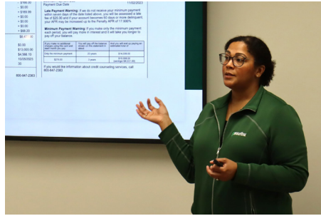
MSUFCU partners with HRS teaching financial education.