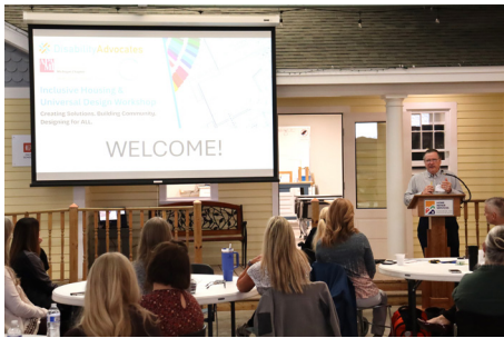
HRS opens space for a design workshop led by Disability Advocates of Kent County.