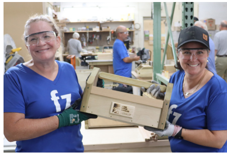
Feyen Zylstra volunteers do a learn & work at HRS.