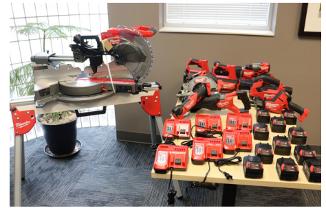
Beautiful new tools donated to HRS by Milwaukee Tool.