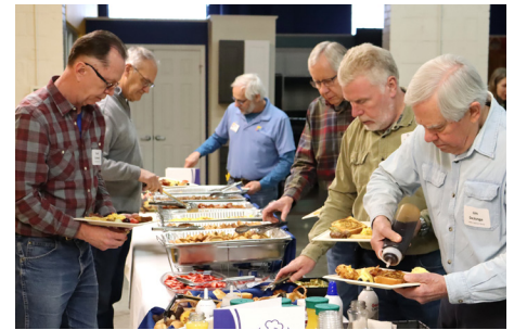
Annual Volunteer Appreciation Breakfast feast.