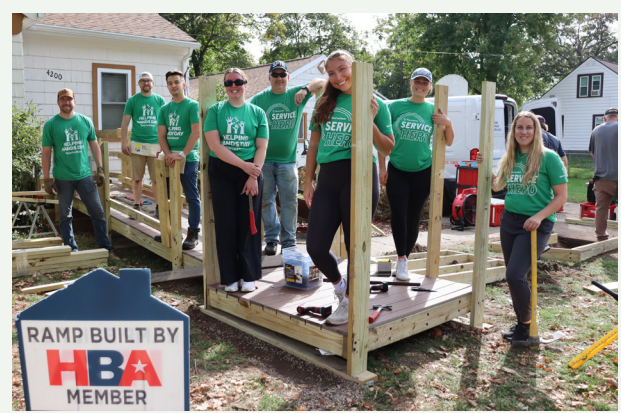
SpartanNash team members have volunteered to construct seven ramps since April of 2024.